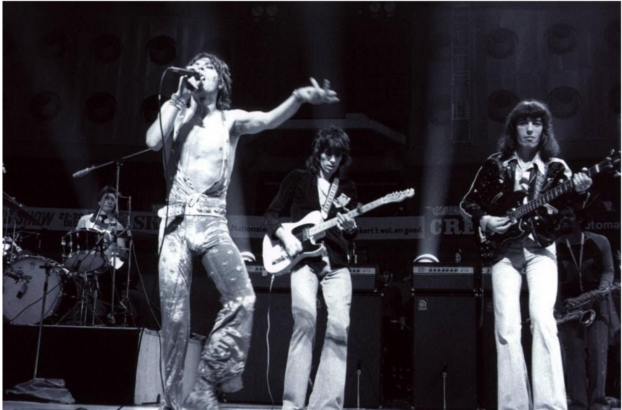
NETHERLANDS - OCTOBER 13: ROTTERDAM Photo of ROLLING STONES, L-R: Charlie Watts, Mick Jagger, ... [+]

Had it been somewhat normal times, the Rolling Stones would've performed dates this year as part of their No Filter tour of North America. But even the unstoppable 'World's Greatest Rock and Roll Band' became sidelined due to the pandemic, resulting in the tour being postponed (Fortunately it didn't stop them from putting out a new song, the very appropriately titled " Living in a