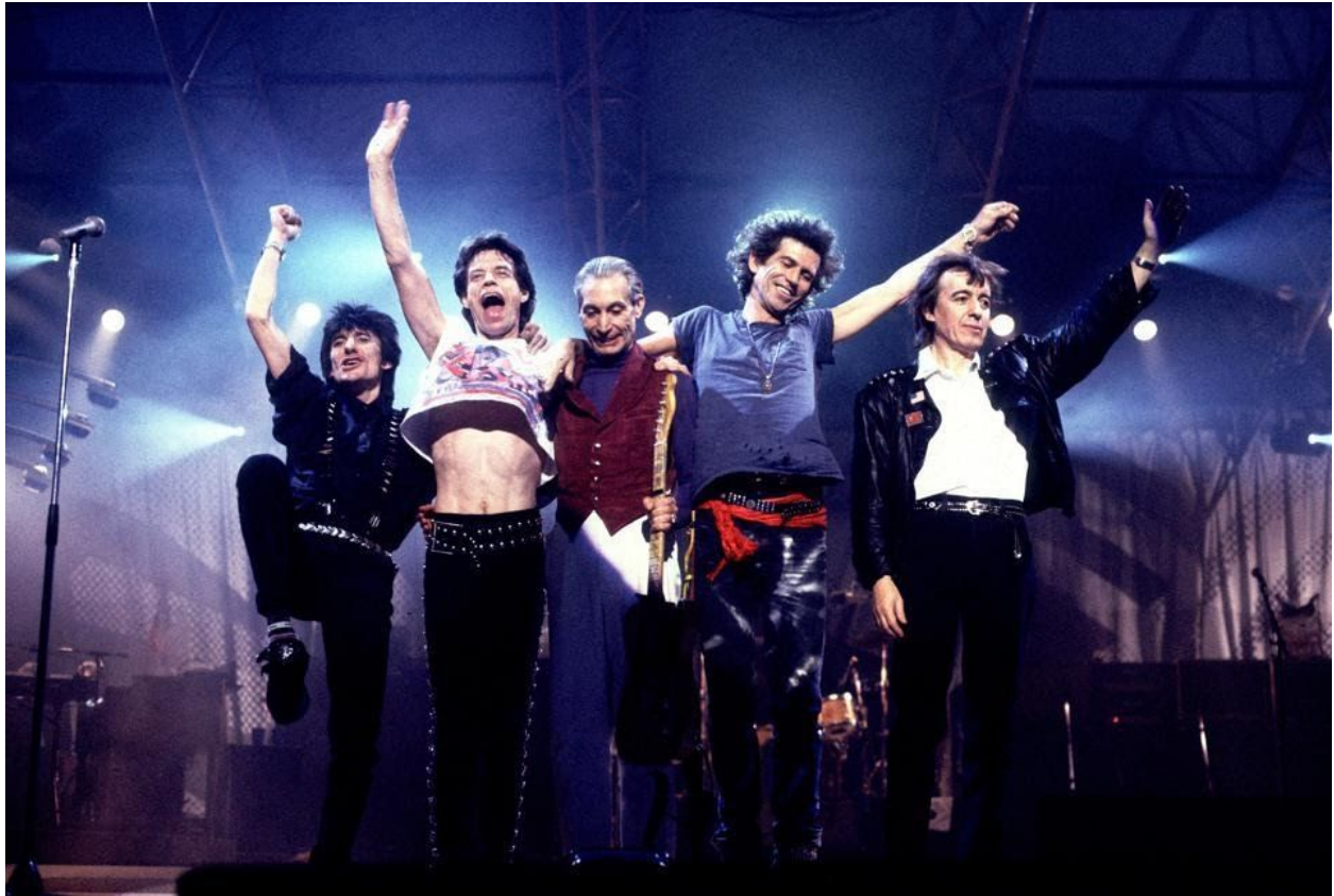
Left to right: Ron Wood, Mick Jagger, Charlie Watts, Keith Richards and Bill Wyman of the Rolling ... [+]

Affair . Not that this newly deluxe treatment of Goats Head Soup needed the bells and whistles to show what a good, if not perfect, album it is—but it certainly doesn't hurt either.